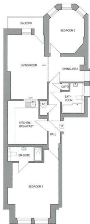
THIRD FLOOR Flat 11